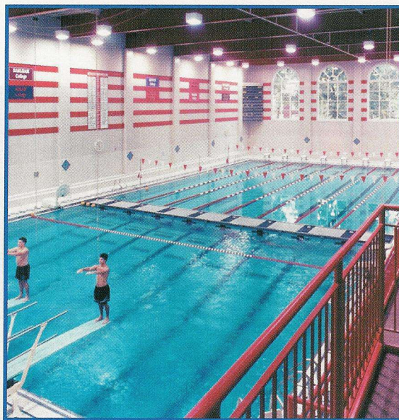
An eight-lane pool is among the new additions.