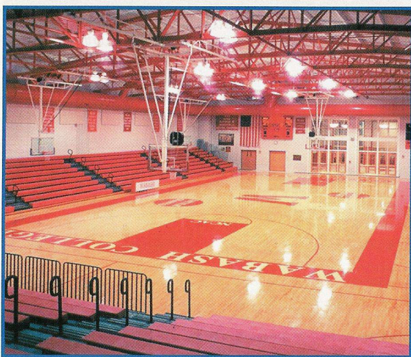
Chadwick Court was renovated with new flooring, bleachers, audio systems, HVAC systems, lighting and scoreboards.