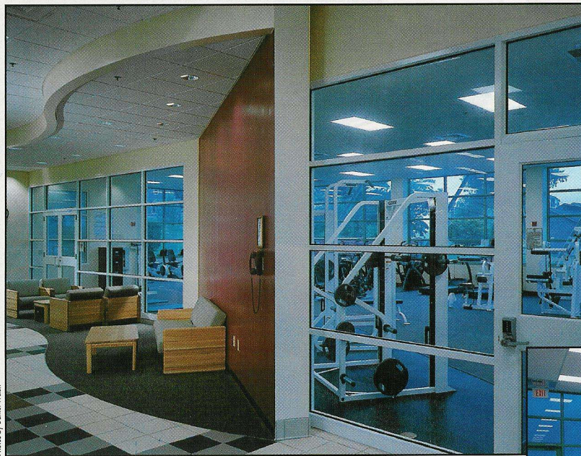
THE MAIN LOBBY'S LOUNGE SERVES AS A CENTRAL MEETING PLACE, AND GUESTS CAN STORE THEIR PERSONAL BELONGINGS IN NEARBY "CUBBIES."