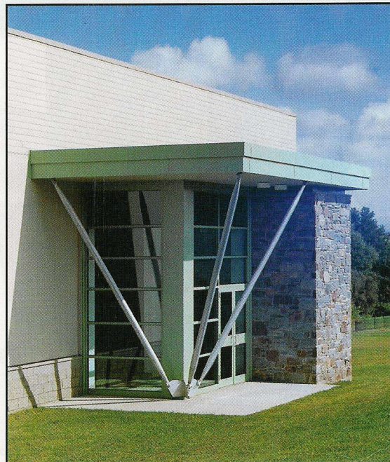
THE ONE-STORY SQUASH & FITNESS CENTER FEATURES A COMBINATION OF GRAY CEDAR SIDING, GRAY SPLIT-FACED CONCRETE BLOCK, FIELDSTONE AND LIGHT GREEN-TINTED GLASS.

The school's maroon-and-black color theme is carried throughout the flooring, carpeting, finishes, trim and accents.