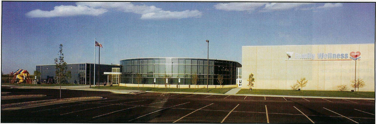
Architectural precast concrete, glass and glazed masonry were utilized to signify the wellness center's various elements.