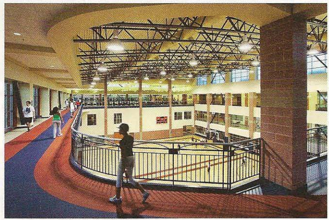
The jogging track cuts through the cardio space on the upper level as it encircles the two-court gym.